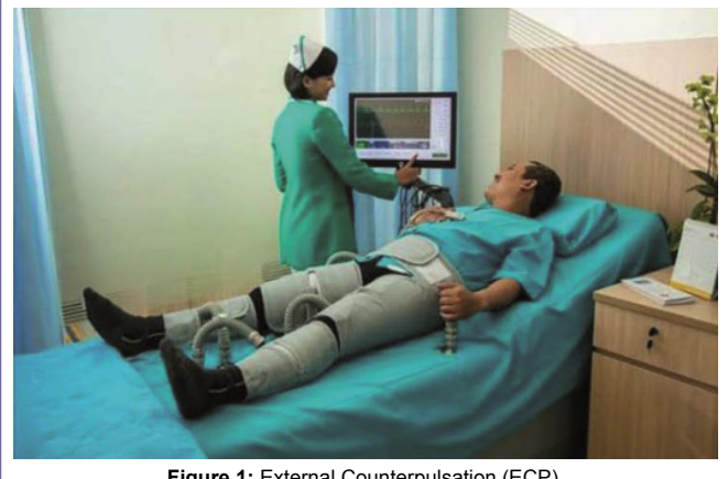
Figure 1: External Counterpulsation (ECP)

Patients with refractory angina present with recurrent episodes of angina, some of which may be both limiting and severe and experience very poor quality of life despite optimized medical treatment [13]. A number of non-pharmacological methods also have been proposed for the treatment of RAP. However, from relevant medical evidence, only three are currently recommended: External Counter-Pulsation (ECP) and two neurostimulatory methods - Transcutaneous Electrical Nerve Stimulation (TENS) and Spinal Cord Stimulation (SCS). ECP uses the principle of intra-aortic counterpulsation similar to Intra-Aortic Balloon Counterpulsation (IABC). ECP consists of three pairs of pneumatic cuffs placed on the legs, which are inflated above the systolic blood pressure during diastole and deflated in systole according to ECG synchronization (Figure 1).